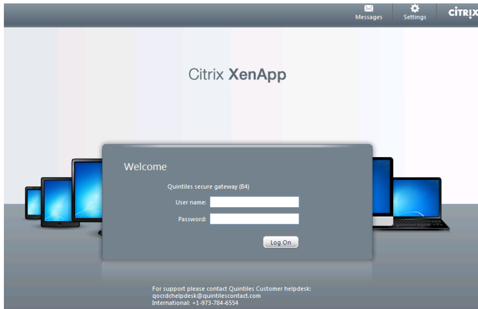
Figure 1 – login screen

Once logged in, the user will be able to launch the vDesk application