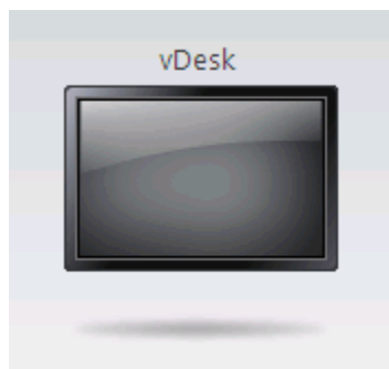
Figure 2 – vDesk launch icon

(user can drag & drop this icon on his own desktop for future faster vDesk launch)